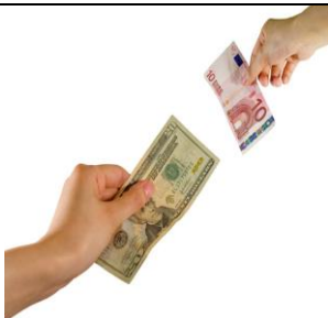
5. _____ money