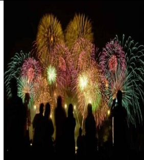
4. Watch _____