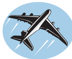
10 _____ by plane