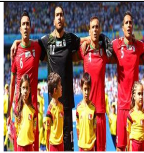
2. Sing National _____