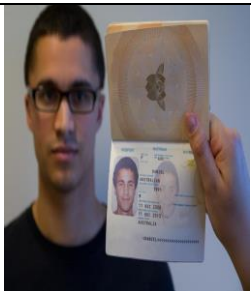
7 _____ the passport