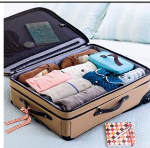
6 _____ for a trip