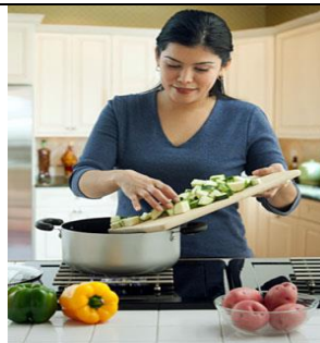
8 _____ dinner