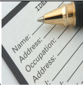
1 _____ out the form

۷. با توجه به تصاویر، کلمات مناسب را در جای خالی بنویسید (۵)